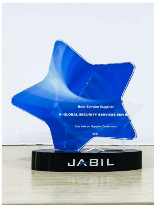
BEST SERVICE SUPPLIER Asia Indirect Supplier Conference Jabil Circuit Sdn. Bhd.