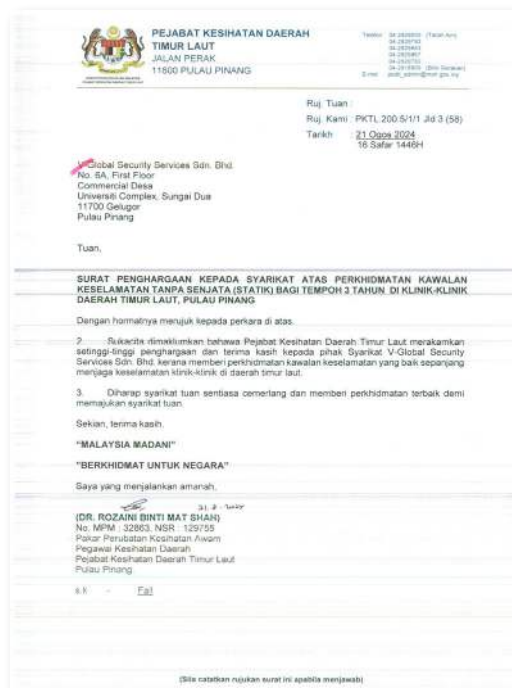
LETTER OF APPRECIATION Pejabat Kesihatan Daerah Timur Laut