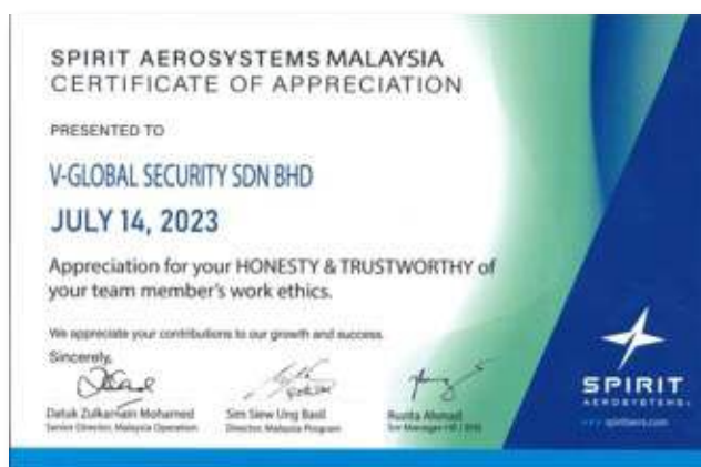
APPRECIATION FOR HONESTY & TRUSTWORTHY Spirit Aerosystems Malaysia Sdn. Bhd.