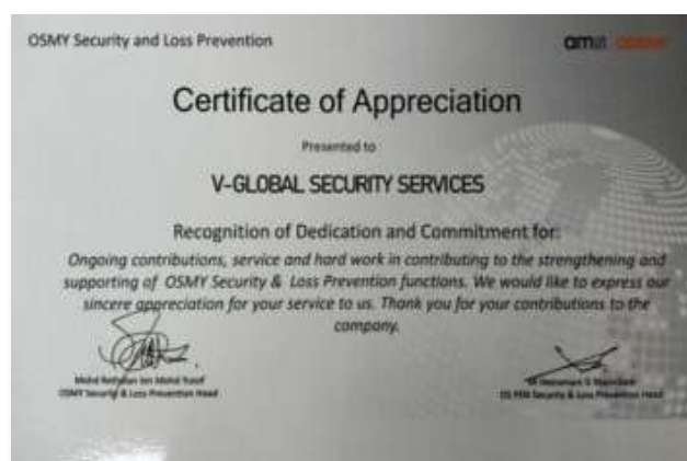
CERTIFICATE OF APPRECIATION ams OSRAM Opto Semiconductors (M) Sdn Bhd